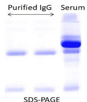
Fig.2 Antibody purification by BcMag<sup>TM</sup> One-minute antibody purification Kit

It will not influence the immuno-reactivity of most antibodies once a Neutralization Buffer is added, immediately neutralizing the eluted fraction. However, a few antibodies (e.g., some monoclonal antibodies) are acid-labile and can irreversibly lose their activity at very low pH values. For those low pH sensitive antibodies, One-Step Antibody Purification Kit is an alternative method for antibody purification. The kit is a rapid, one-step, and effective method of isolating the antibodies from serum and other sample types. The magnetic beads bind and remove serum proteins, allowing pure IgG to be collected in the supernatants (Fig.2). The antibody keeps 100% activity since no harsh elution conditions are involved.